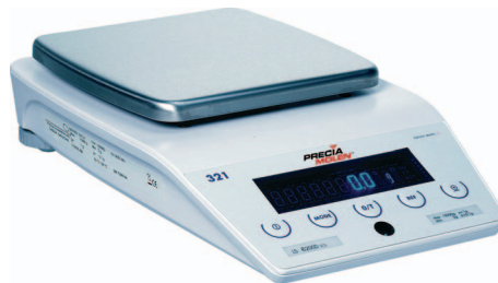
LS 4200C LS 3200D LS 6200D